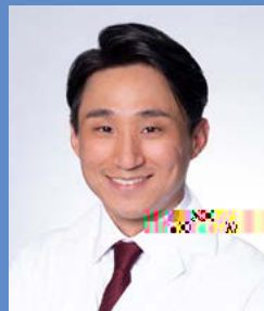
Director, Emergency Ultrasound